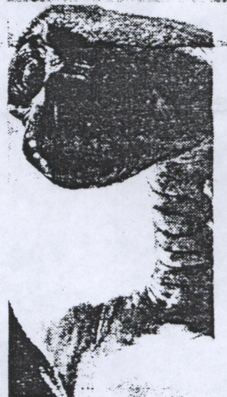
E.T. . . . still hasn't phoned